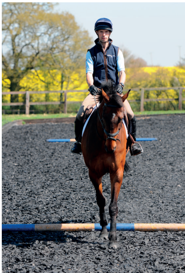
Support the horse with the outside aids as you come down the poles to keep them straight