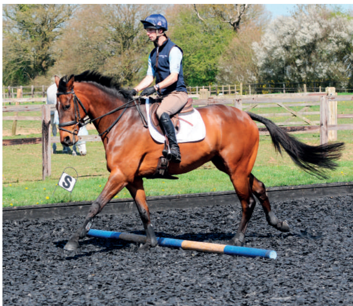
Canter over the first pole out of the same regular canter rhythm regardless of whether you are going to move or wait

horse (and rider!) will naturally knife in and cut across each corner. This exercise will aid straightness as you ride from point to point down the poles and will encourage the horse to stay straight through their body and work through their back. It will also help develop riding a correct and balanced turn. You can use subtle counter flexion on the straight lines to bring the horse onto two tracks in order to develop true straightness. By riding in from the track, you don't have the wall to balance so it encourages the rider to use their outside aids to keep the horse straight.