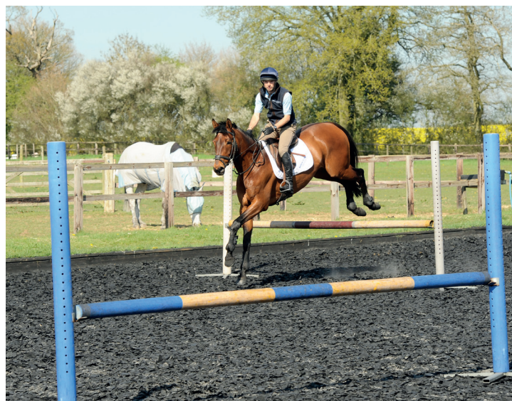
Control the outside shoulders on the turn so the horse doesn't drift out

If your horse is struggling to maintain the canter rhythm and balance on the turn then try just linking two fences together to begin with and