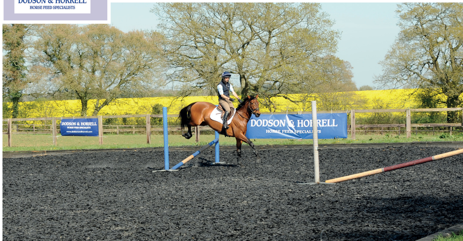
Keep your body central and look for the next fence so the horse knows where to go on landing

"You will find a comfortable distance throughout depending on the size of the circle and how well it fits to the horse's stride. It is normally 3-4 strides for a 20-25m circle, however, it doesn't