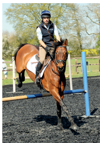
You can turn out of the circle at any point by turning the opposite way on landing

If ridden correctly, this exercise will improve agility, the quality of the canter and overall control of the pace, the striding and the horse's positioning.