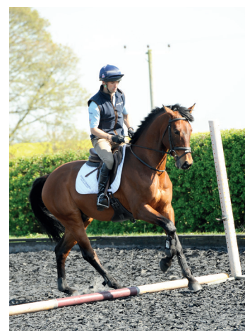
Concentrate on being in the centre of each pole

"You start with the four poles on the ground and there is no real given distance between each pole, so just jump through in a balanced canter to establish your stride. Make sure you jump each pole where you intend to (over the centre stripe), this prevents you from falling in or cutting out on the turns and gets you used to aiming for a specific part of the jump.